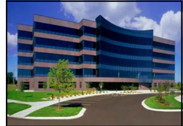
Gillware Inc. is located at 10 Terrace Court

For more information, contact Tyler Gill at 240-237-8780.