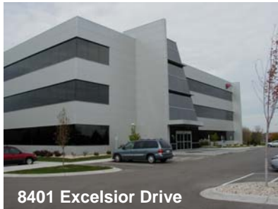
8401 Excelsior Drive