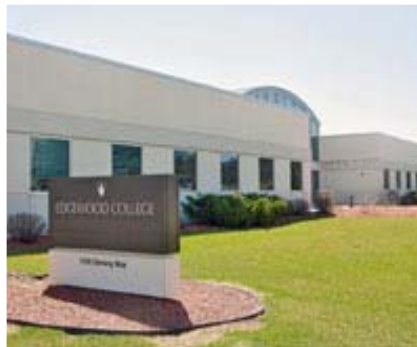
Edgewood College Deming Way Campus is located at 1255 Deming Way

Savant Capital Management, Inc. is a Registered Investment Advisor.