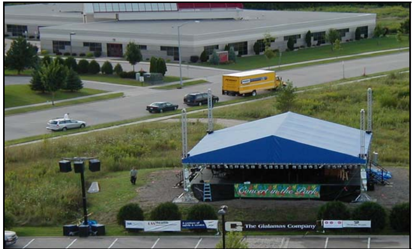
With the set-up complete, guests begin to arrive at Concert in the Park 2004

After many hours of - will it rain, will the sun come out, should the set up start, it was decided to go ahead and hold Concert in the Park. Because the decision of whether to hold the concert or postpone until the rain date was not made until 12:00 pm, set up for the concert had been delayed for 3 hours. Once the decision had been made to go ahead, the race was on. Sound, lighting, the stage, tables and chairs, and the fireworks display all had to be set and ready in 4 hours. The mission was accomplished, the clouds departed and the sun came out. People started arriving at 5:00 pm and soon everyone was ready for the music to begin. Well over 2,000 people attended this year's event.