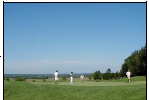
Despite the rainy morning, the afternoon turned out sunny and warm at Bishop's Bay Country Club for the Old Sauk Trails Golf Outing.

Thanks to the many donations from these businesses: George's Chop House, Holiday Inn & Suites, AAA Wisconsin, Auto Glass Specialists, Swimwest, Group Health Cooperative, Houlihans, Ginos, Steve's Liquors, Damons, and Gannett Fleming, there were many raffle prizes given out at the dinner following the golf outing.