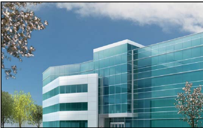
View of 8040 Excelsior Drive traveling west on the beltline.

The most energy efficient Low E glass available will be used allowing in natural light while reducing solar gain and heat loss. The 10-foot high ceilings with 7 feet of vision panel will let in more natural light thus reducing lighting cost. With reduced lighting loads, the cooling load is reduced on the HVAC system which will save energy.