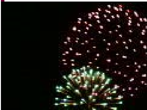
The fireworks display immediately following the concert was a great success.

Concert in the Park continues to grow and become a wonderful event for everyone in the park. All of the underwriters and sponsors hope that you had a wonderful time this year and will continue to make this an event that is one of the summer highlights of working in Old Sauk Trails Park.