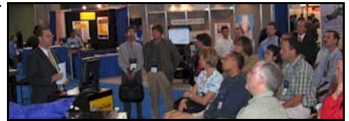
TomoTherapy presentation at ASTRO 2004

TomoTherapy was also well-represented in ASTRO's Scientific Sessions, with several TomoTherapy clinicians presenting their latest clinical Hi·Art data, covering thousands of TomoTherapy IGRT procedures.