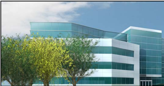
View of 8040 Excelsior Drive from the drive way off of Excelsior Drive.

The Gialamas Company will begin construction of a new building at 8040 Excelsior Drive in Old Sauk Trails Park in November, 2004. It will be 95,000 square feet building.