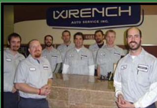
The staff at Wrench Auto Service

Wrench Auto Service is pleased to announce free pick-up and drop-off services for all tenants in the Old Sauk Trails Park area.