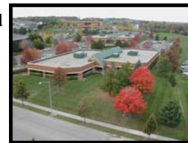
Park Centres I & II

The Turn Around Teen staff is delighted with the very attractive and functional office suite created by The Gialamas Company, and looks forward to serving an ever-growing number of families at this location. For more information, call their office at 829-2031, email them at turnaroundteen@tds.net , or visit www.turnaroundteen.org .