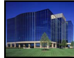
Sauk Trails Plaza, the new home of Dean Health

Dean Health System Hematology/Oncology will be moving to Old Sauk Trails Park from their clinic location at 1313 Fish Hatchery Rd. to Sauk Trails Plaza located at 1200 John Q. Hammons Drive. Dean will occupy 18,600 square feet, which is the entire fourth floor at Sauk Trails Plaza. The move is targeted for late June or early July 2006. Their new space will include approximately 12 exam rooms, two procedure rooms, 40 chemo/infusion chairs as well as lab and general radiology services.